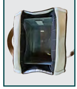
Personalise your carry bag by engraving your name on it for only R65 extra.